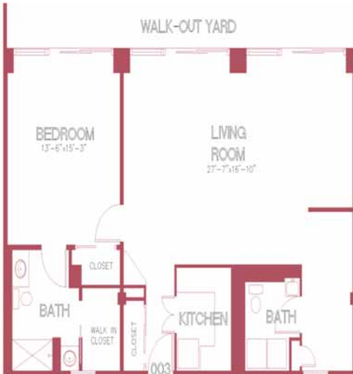
Floor Plan F 1000 Sq. Ft.