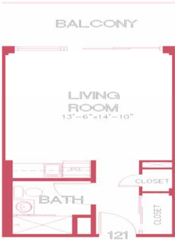
Floor Plan A 325 Sq. Ft.