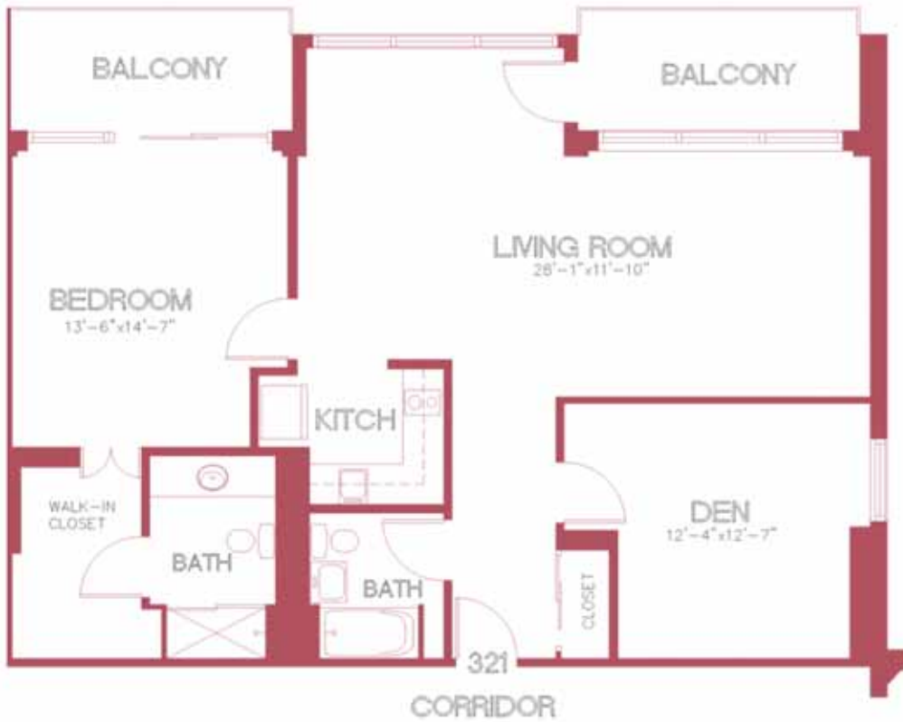
Floor Plan G 1050 Sq. Ft.