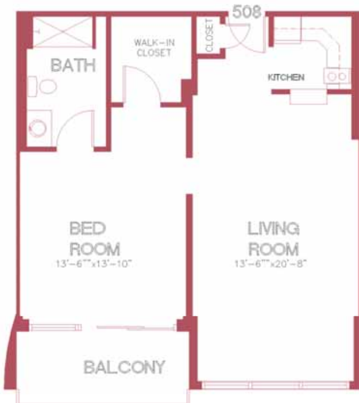
Floor Plan D 735 Sq. Ft.