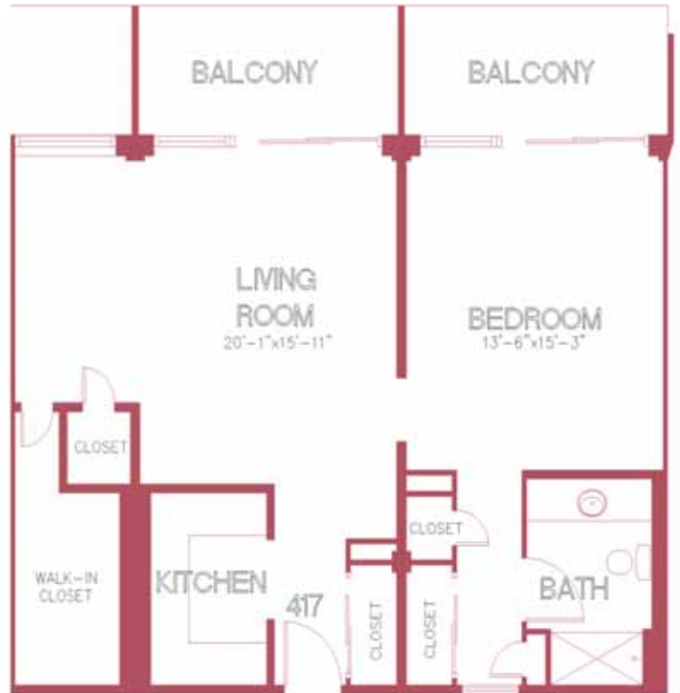
Floor Plan E 755 to 775 Sq. Ft.